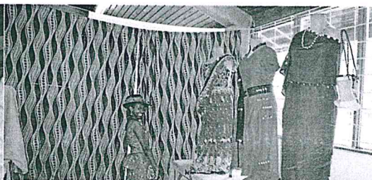
School of Hospitality & Textile Technology

Kirinyaga University Mobile: +254 709 742000 P.O.Box: 143-10300 Kerugoya. Email: info@kyu.ac.ke Web: www.kyu.ac.ke