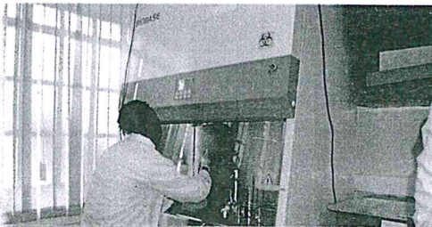
School of Health Sciences