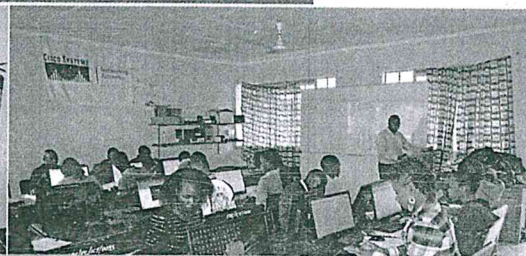
School of Pure & Applied Sciences