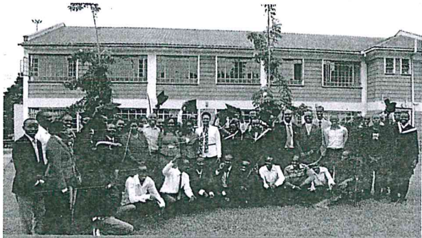
School of Business & Economics